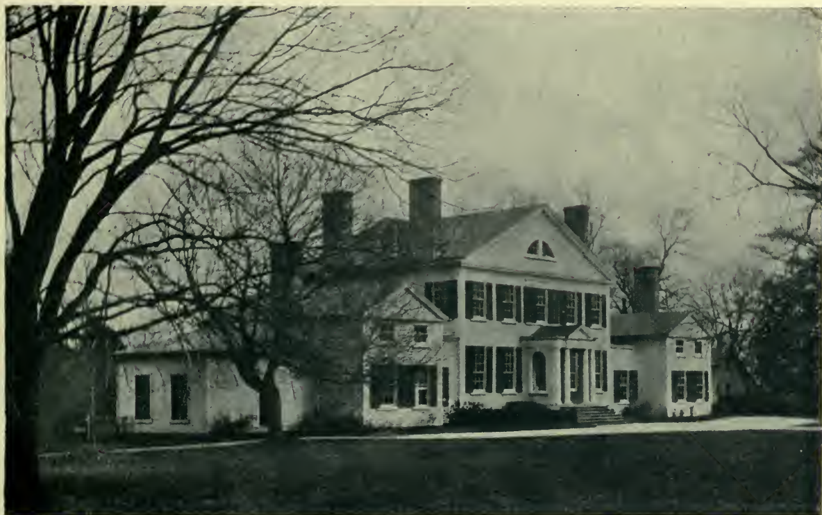
WYE HOUSE, TALBOT COUNTY, MARYLAND. Built about 1780

Probably the most notable of Virginia plantations, the home of George Washington